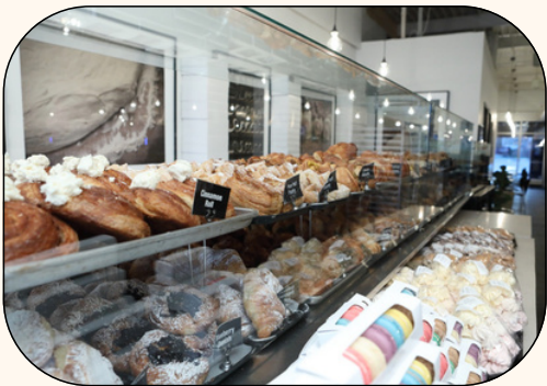
LA MIE: PATISSERIE, BOULANGERIE, AND CAFE