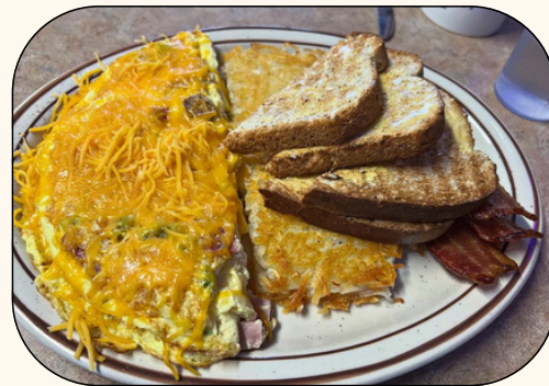
WAVELAND CAFE: DIVE-STYLE BREAKFAST